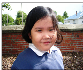
Gilli Rm 10